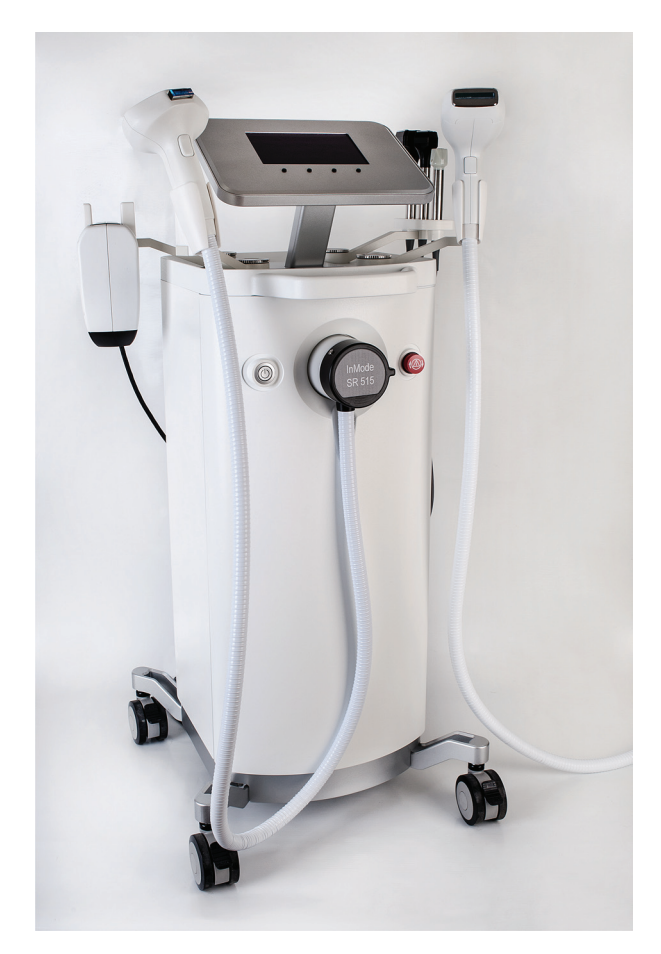
Figure 1. InMode Device.

ultrasound gel was used for the LUMECCA and FORMA treatment, whereas for the FRACTORA, skin was topically anesthetized with EMLA 5% and completely dried before treatment with alcohol 70%.