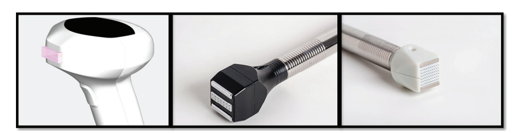
Figure 2. Images of the 3 applications of InMode: LUMECCA (left), FORMA (center), and FRACTORA with 60-pin tip (right).

Safety assessment was done by the investigator by recording any adverse event other than expected transient mild or moderate erythema and edema that do not require any intervention, and