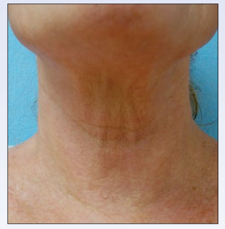
64 year old patient eight weeks after one Fractora Tx session (two passes with 60 pin applicator, 211 pulses)