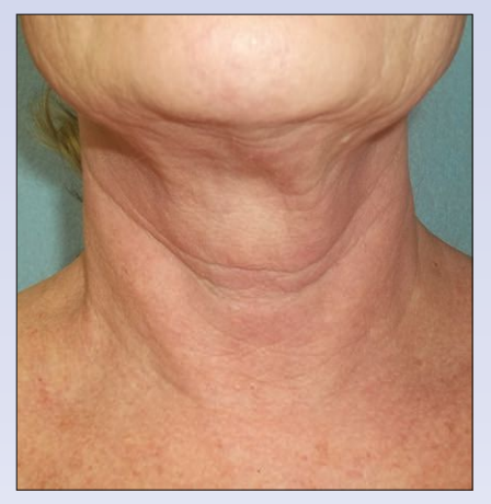
64 year old patient before Tx